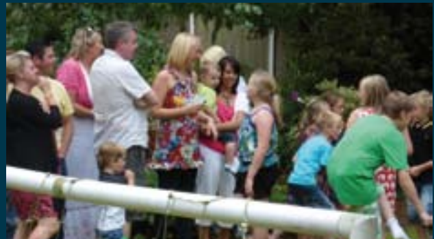
Nervous anticipation from the crowd